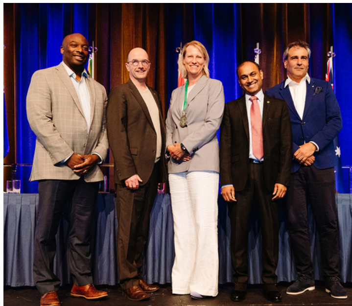
2022-2023 COA Presidential Line